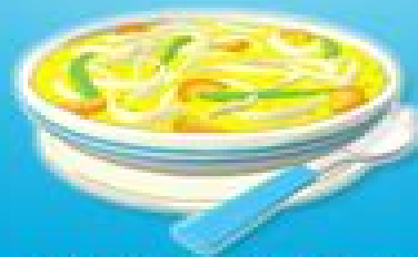
Chicken Noodle Soup