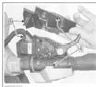
Image 1: Ensure engagement of housing cover retaining tabs. Image 2: Ensure engagement of cover housing retaining tabs.