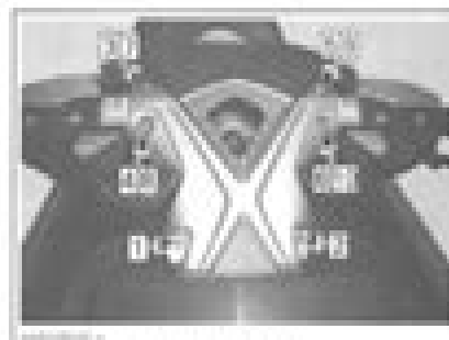
Image 1: Remove the extension block. Image 2: Install the extension block.

The installation is the reverse of the removal procedure. However, pay attention to the following. Tighten bolts to 55Nm (40.5ft•lb) using the following sequence: