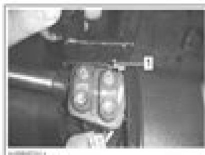
Image 1: Position the cover. Image 2: Press on the cover to lock it.