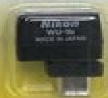
WU-1b Wireless Mobile Adapter

Slip the case onto your camera strap for quick and easy access.