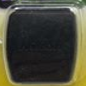
WU-1b Wireless Mobile Adapter Case

Slip the case onto your camera strap for quick and easy access.