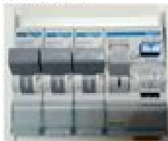
Use chart B

The Test buttons on the following RCD's can get stuck when testing which will trip your RCD