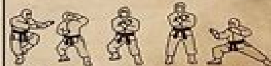
HICHO KOSEI JUMONJI HENKA JUMONJI KIKOU IKEN HAGI