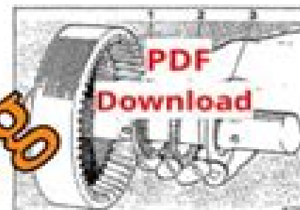
Fig. 11B-15 Fitting the races and thrust bearing to the inner face of the rear internal gear

18. Examine the steel plates for scoring and scoring. If scoring has occurred, the steel plates are damaged and replacement is required.