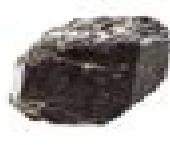
schorl (black tourmaline)