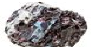
kyanite, biotite, tourmaline on gneiss