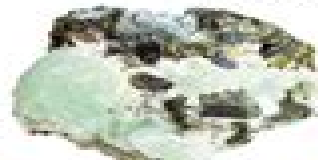
prehnite with epidote