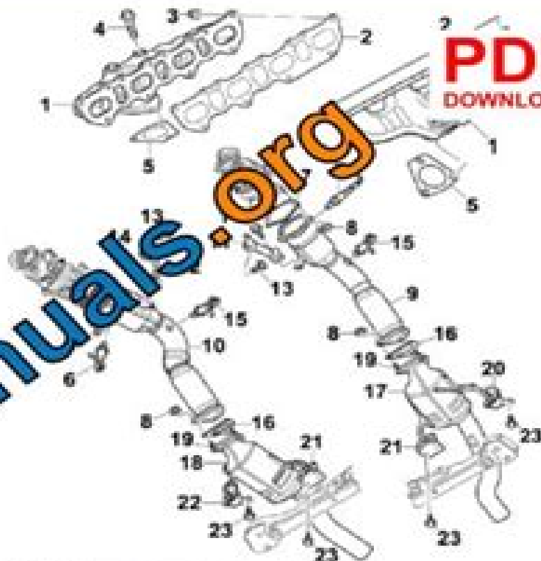
Fig. 88: Component overview - Cayenne Turbo