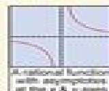
A rational function with asymptotes at x=0 & y=0 .

The branches of rational functions approach asymptotes.