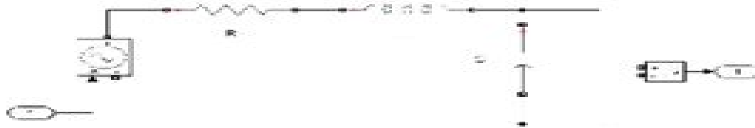
Figure 2: RLC series in MATLAB SIMULINK

The voltage equation for a series RLC circuit using Kirchhoff's Voltage Law (KVL) is: