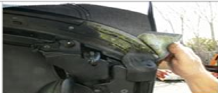
Step 25: FRONT CORNER FLAPS. Apply contact cement by spray to top front corner flaps and frame.