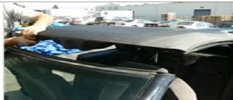
Step 28: TRIM EXCESS After dry time attach together equally and trim off excess material.