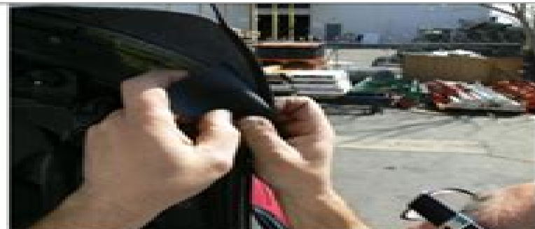
Step 26: FRONT CORNER FLAPS. After five minutes dry time attach corner to frame.