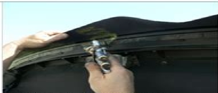
Step 27: APPLY CONTACT CEMENT Apply contact cement across top and frame.