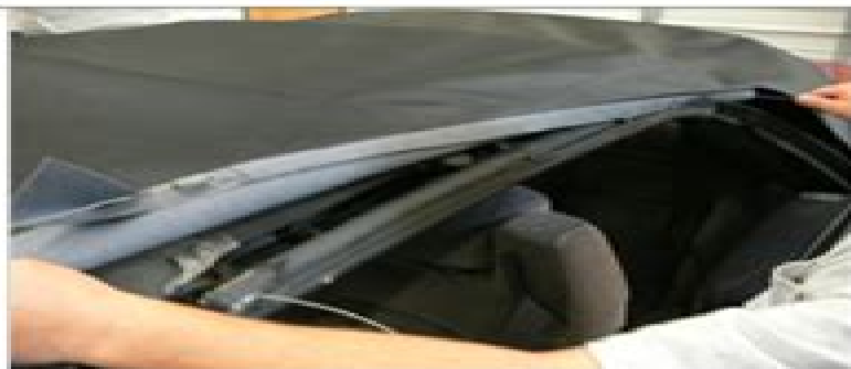
Step 23: INSERT SIDE CABLES Insert side cables from front of top side pockets and screw in back end with spring to frame.