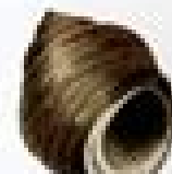
Common Periwinkle (B,V)

Euryspira angulata To 1 in. (2.5 cm) high Shell has 8-10 ribs, blade-like ribs.