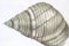
Marsh Periwinkle (CB,V)

Euryspira caudata To 1.5 in. (3.8 cm) high Small shell has a pointed apex and spiral ridges. Feeds primarily on oysters.