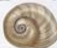
Shark Eye (E)

Tegula funiculata To 1 in. (2.5 cm) Rounded, black shell with a smooth apex.