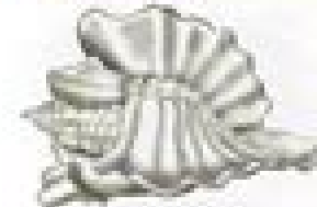
Foliate Thornmouth (W)

Cerithium foliatum To 1.5 in. (3.8 cm) high Shell has three large, leaf-like flanges. Color varies from white to dark brown depending on location.