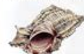
Carinate Downsail (W)

Murex filiculus To 1 in. (2.5 cm) Elaborate pinkish-white to brownish shell with long flaps.