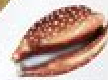
Atlantic Deer Cowrie (CB,CB)

Olivella septentrionalis To 2.5 in. (6.3 cm) Olive, yellow to grayish cylindrical shell has markings that resemble lettering. South Carolina's state shell.