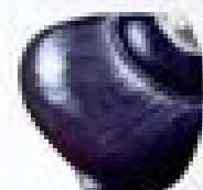
Black Top Shell (W)

Polinices bipartitus To 1 in. (2.5 cm) high Rounded shell is grayish to brownish, (dark to red) to bore holes into biofilms.