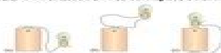
Fig. 1. In which case battery would the light bulb illuminate?

circuit: _____ current: _____ volt: _____ battery: _____ resistor: _____