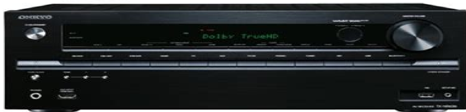
Black and Silver models