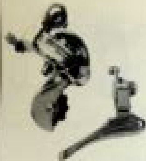
NEW SUCCESS SPORT