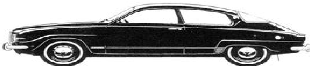
SAAB 96 (SAAB 2 DOOR SEDAN)