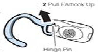
2 Pull Earhook Up