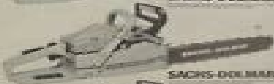
SACHS DOLMAY 111.11