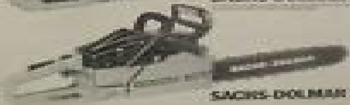
SACHS DOLMAY 115