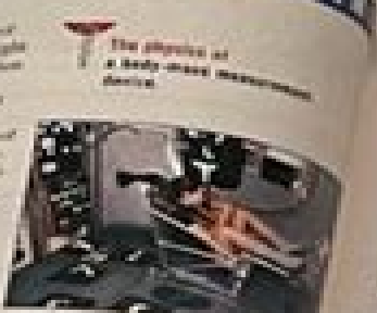
Figure 10.14 A body-mass measurement device is a chair mounted on a spring.