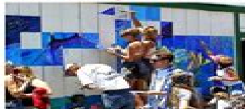
Students gathered to paint the gym wall