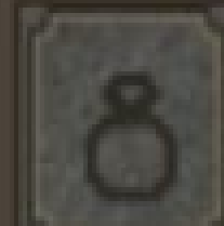
Best F2P Melee Armour