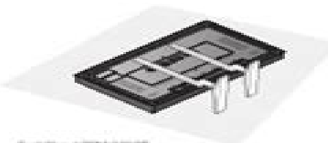
Part No: VESA-3200-2000