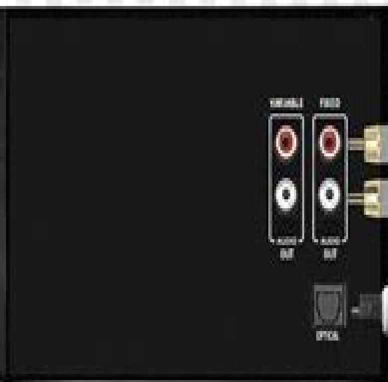
Back Panel of Sound Bar