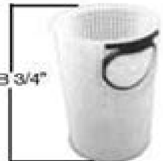
5064-04 MAGNUM & MAGNUM PLUS