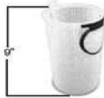
5064-01 MAGNUM FORCE PRIOR TO 2-1-03