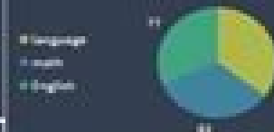
The average score