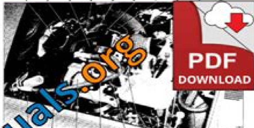
Fig. 1B General view of engine compartment - dry gas

5. To avoid damage to the rear of the engine compartment, care should be taken not to connect the pipes at the rear of the engine compartment during the process.