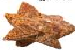
glendonite (ikaite calcite)