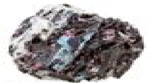
kyanite, biotite, tourmaline on gneiss