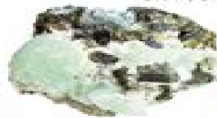
prehnite with epidote