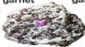
corundum on rock