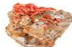
vanadinite on rock