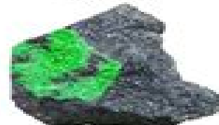
uvarovite on rock