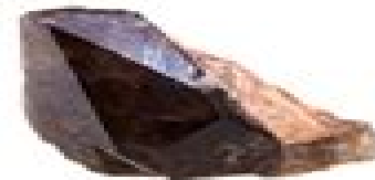
morion (smoky quartz)