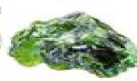
chrome diopside (green diopside)