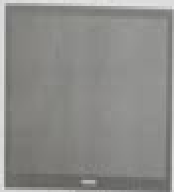
Monitor & Bezel (Ready) (With Bezel)