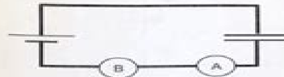
Figure 2: Will A and B light?