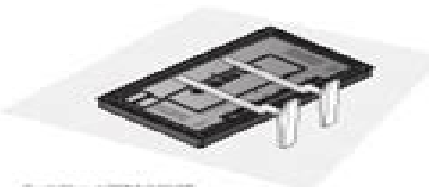
Part No: 40084-20007