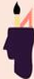
Cognitive Ability Test