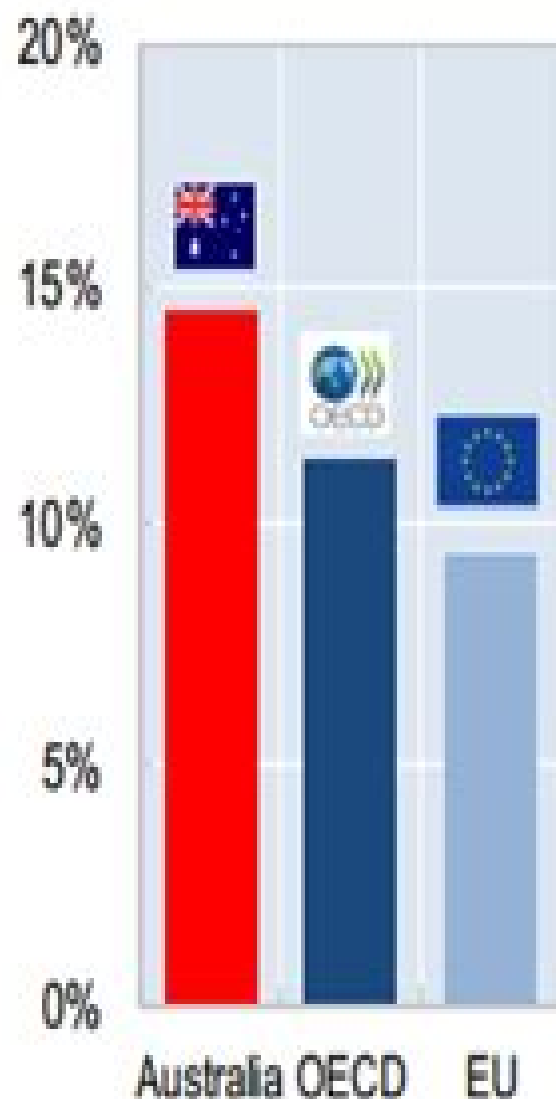
Relative poverty rates % of persons living with less than 50% of median income