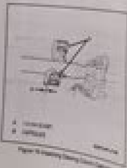
Figure 25.4.4.1.1: Inspecting Steering Column Assembly