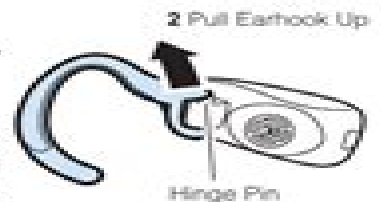
2 Pull Earhook Up