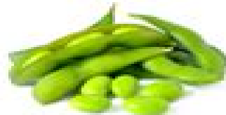
100g edamame/ soya beans 5g fibre