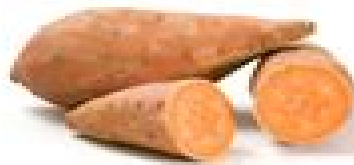
1 Small sweet potato (100g) 3g fibre