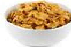
30g bran flakes 5g fibre