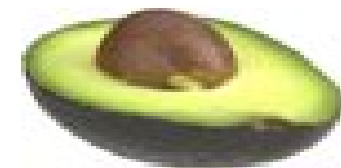
60g avocado 4g fibre