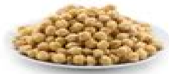
100g chickpeas (canned) 4.5g fibre