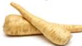
100g parsnip 5g fibre