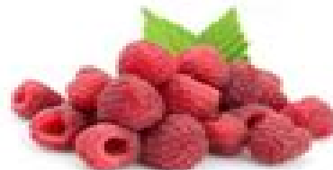
100g raspberries 6.5g fibre