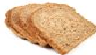
2 slices wholemeal bread 5g fibre