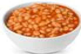
100g baked beans 4g fibre