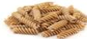
60g wholewheat pasta (dry) 5g fibre