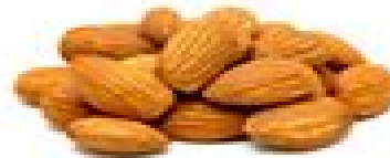
30g almonds 3.5g fibre