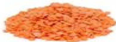
30g lentils (dry) 8g fibre