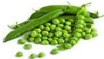
100g green peas 5g fibre