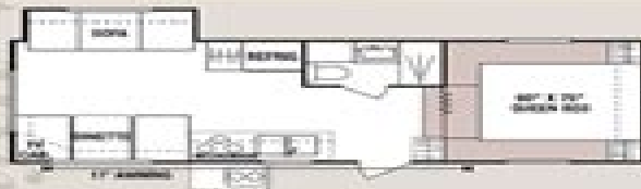
2353P-F - UVW 5460 - Dry Hsch Wt. 1100 - NOC 1540 - Length 25'1"