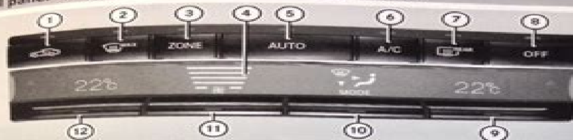
Control panel for dual-zone automatic climate control