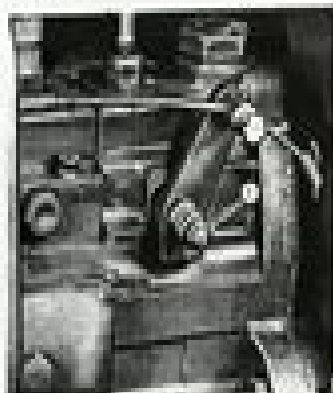
Figure 4 Protecter Fuel Gauge