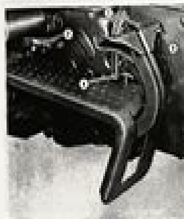
Figure 10 Brake and Rear Axle Controls

The differential lock pedal is shown in Figure 10. Depressing the pedal locks the rear axle shafts together, providing for additional traction in wet or loose soil. Refer to page 10 for differential lock operating information.