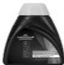
BISSELL 2X Spot & Stain Formula

Keep plenty of genuine BISSELL 2X Portable Cleaning Formula on hand so you can clean whenever it fits your schedule. Always use genuine BISSELL deep cleaning formulas. Non-BISSELL cleaning solutions may harm the machine and will void the warranty.