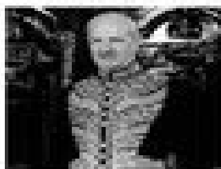
Memorial to the 100th Anniversary

Here is page 1 to give you writing. Begin writing your news article on page 2.