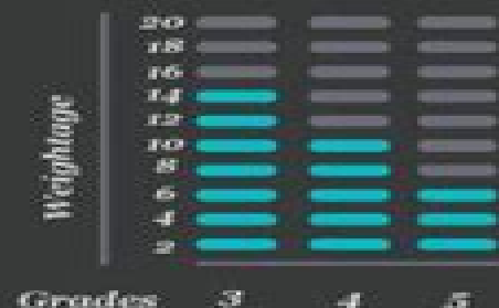
Operations and Algebraic Thinking (OA)