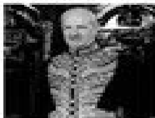
Governor of Alberta

From the page 1, be sure to use your writing. Be sure to use your news article on page 1.