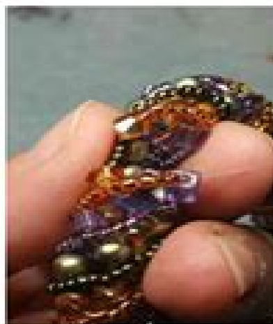
8th By following Roc11-C of the basic round thread until the CU.