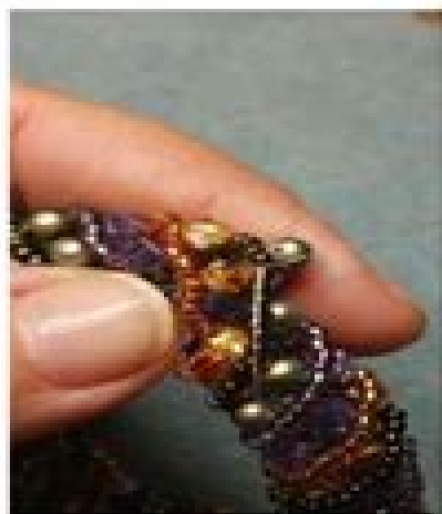
7 Thread through the BC of the basic round.