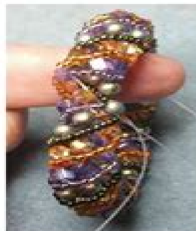
12 Thread the opposite end by the Roc11-A before the CP and the CP.