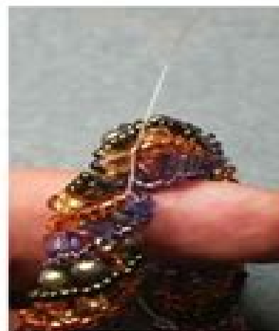
9 pierce through the 1st Roc11-C behind the BC at the other end.