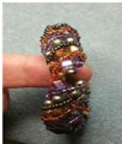
11 Thread through the CU.