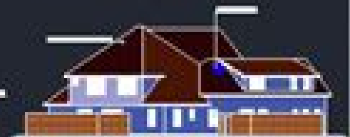
NORTH SIDE ELEVATION