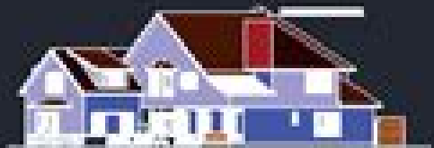
NORTH SIDE ELEVATION