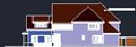
WEST SIDE ELEVATION