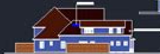
EAST SIDE ELEVATION