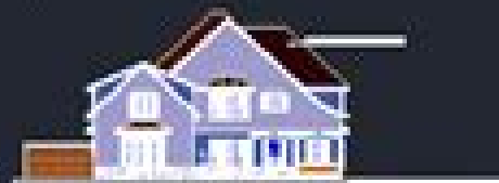
EAST SIDE ELEVATION