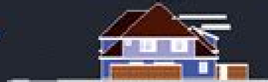
WEST SIDE ELEVATION