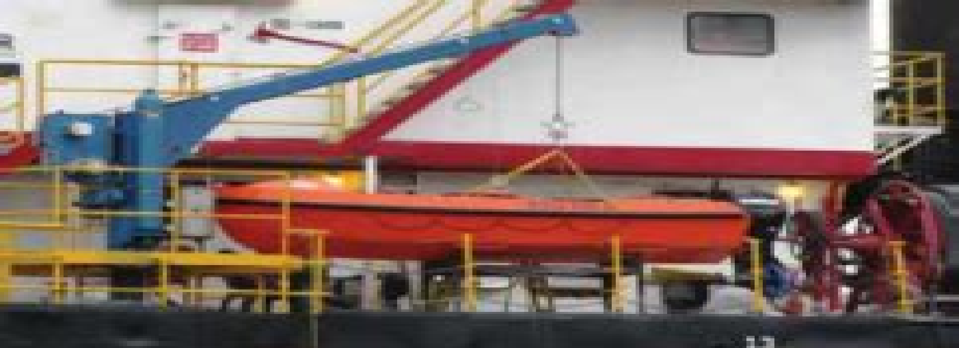
SCH 12-3.5 RESCUE BOAT DAVIT