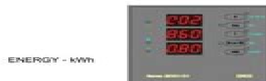
ENERGY - kWh