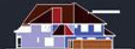
EASTMAN HOUSE NORTH ELEVATION