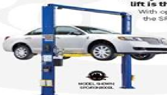
MODEL 94000L SPOA1000L

Rotary's versatile asymmetric two-post lift is the only lift you'll ever need.