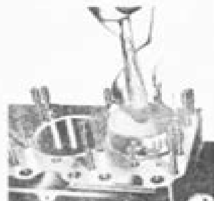
Fig. 216 Detail of 51 car 5.1 compressor water pump

Friction disc — 80.1 lb.ft. — 8.87 ft.lb. (1.5 in.)