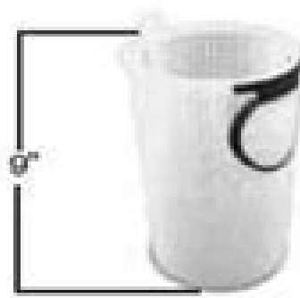
5064-01 MAGNUM FORCE PRIOR TO 2-1-03