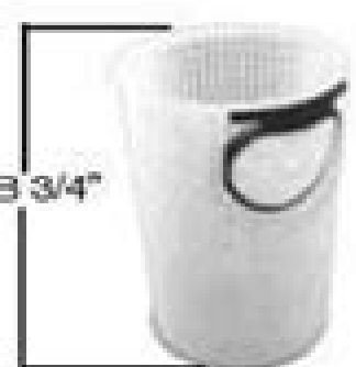
5064-04 MAGNUM & MAGNUM PLUS